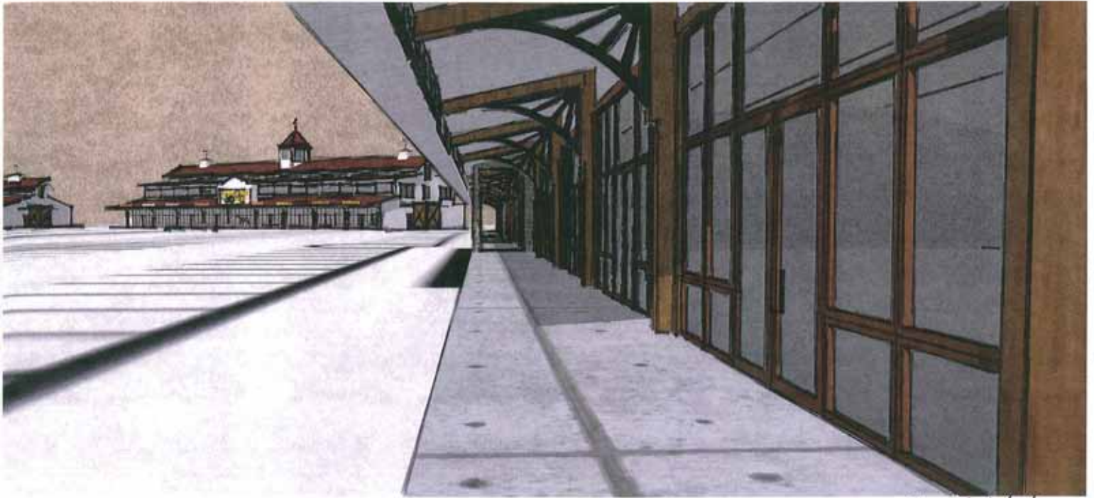
North building, looking west, from Slide Rd.