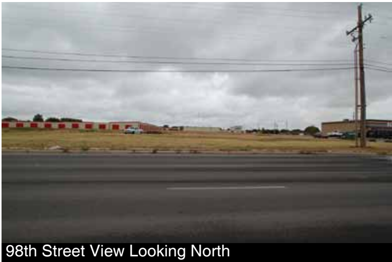
98th Street View Looking North