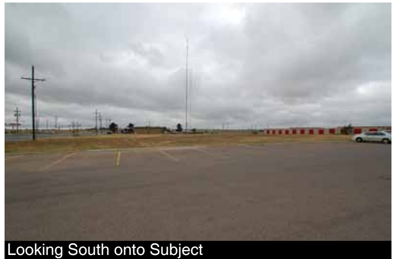
Looking South onto Subject