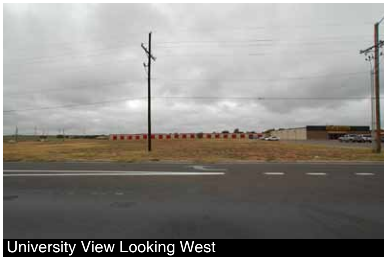
University View Looking West