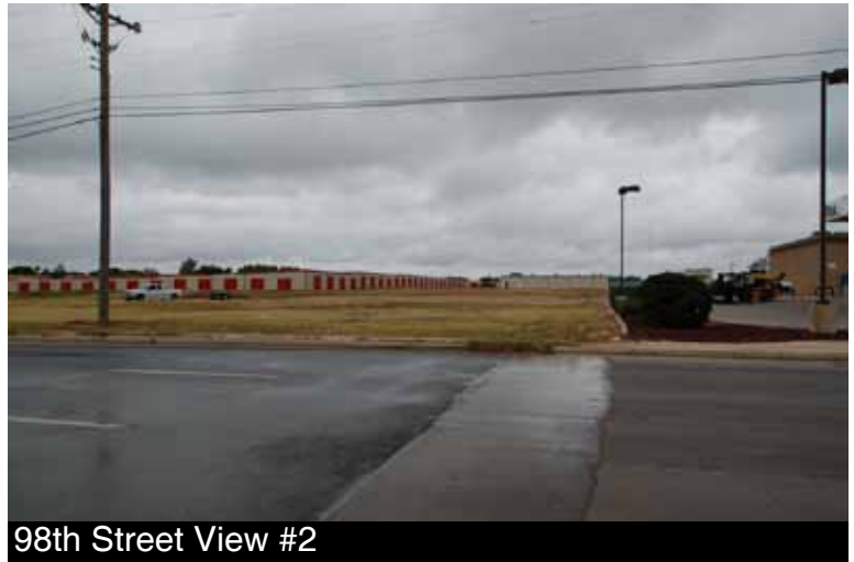
98th Street View #2