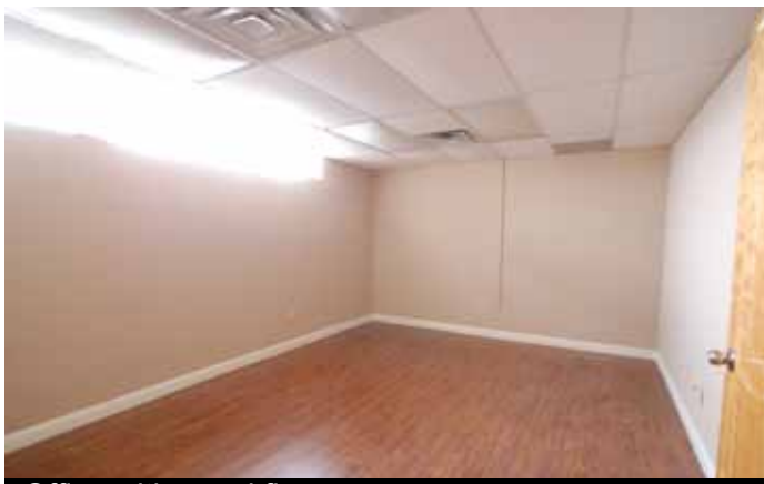
Office with wood floors