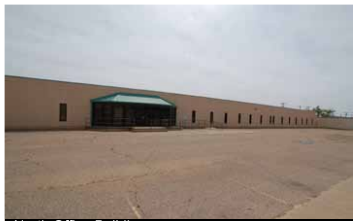
North Office Building