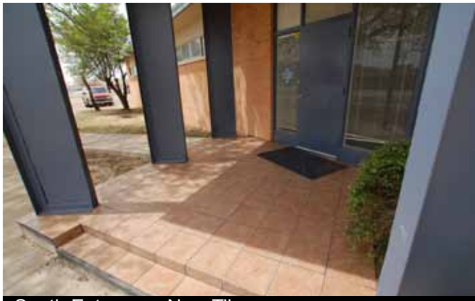
South Entrance - New Tile