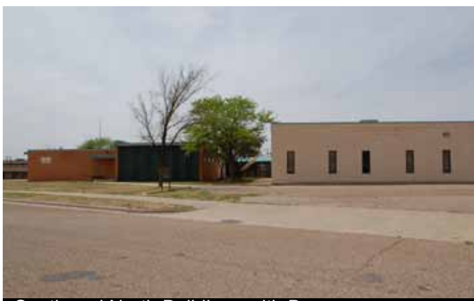
South and North Buildings with Breezeway