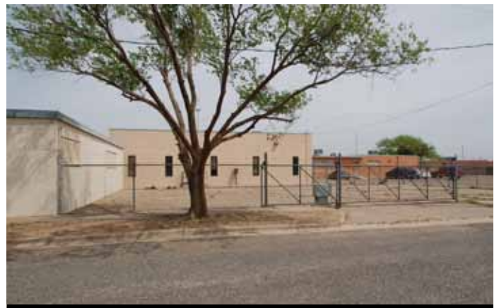
Workshop 1,500 SF & Stack Yard