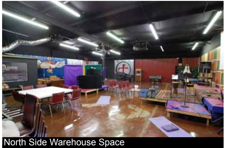
North Side Warehouse Space