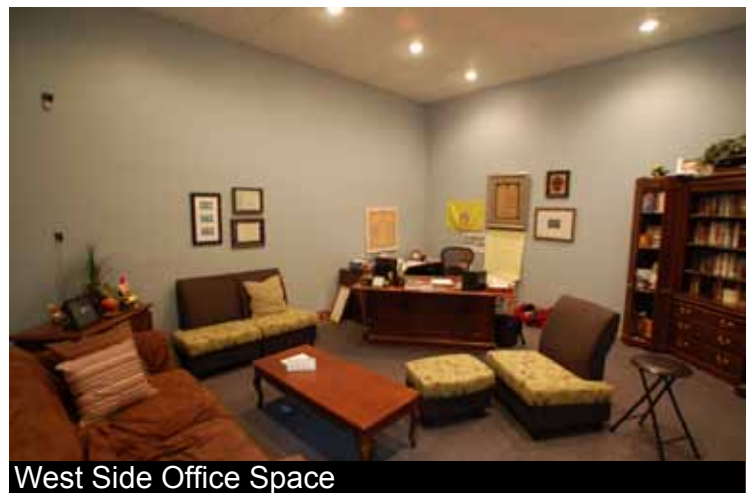
West Side Office Space