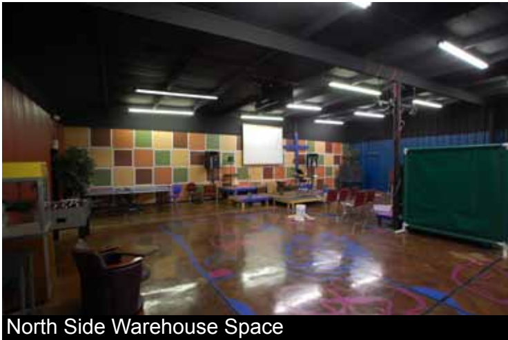
North Side Warehouse Space