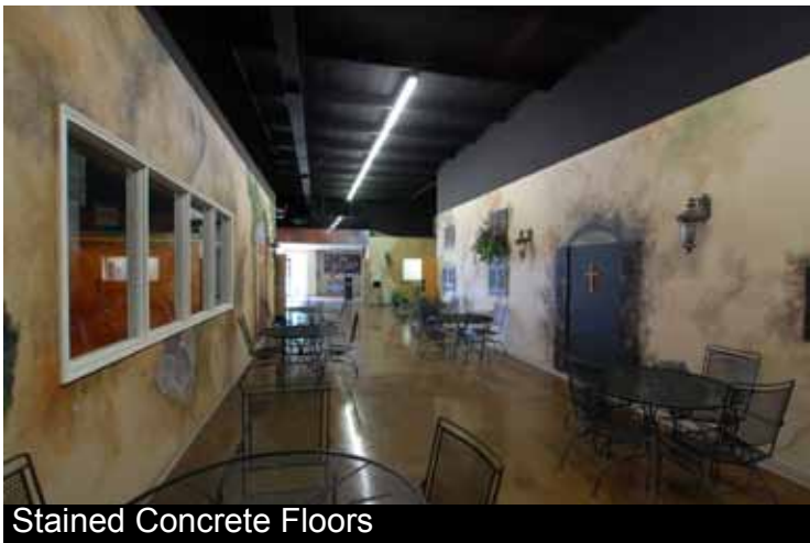
Stained Concrete Floors